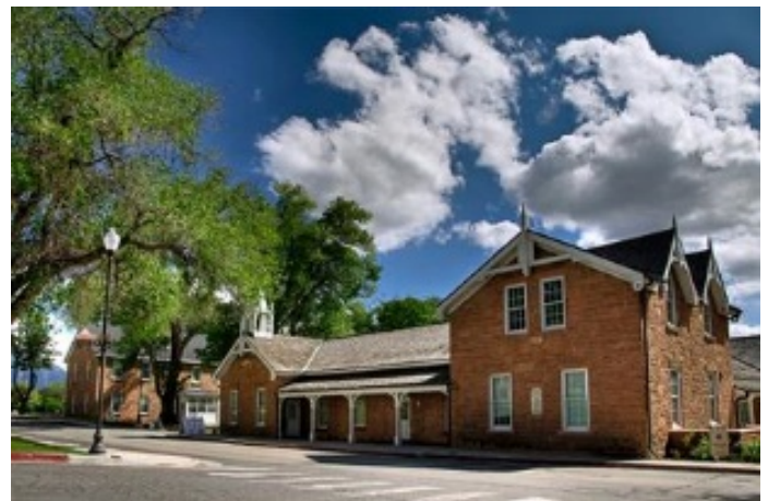
Officers' Club, Ft. Douglas, Univeristy of Utah, where the SCTPLS meetings were held.